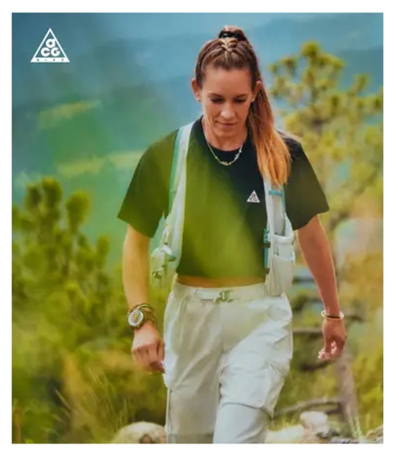
Nike ACG Hiking Gear