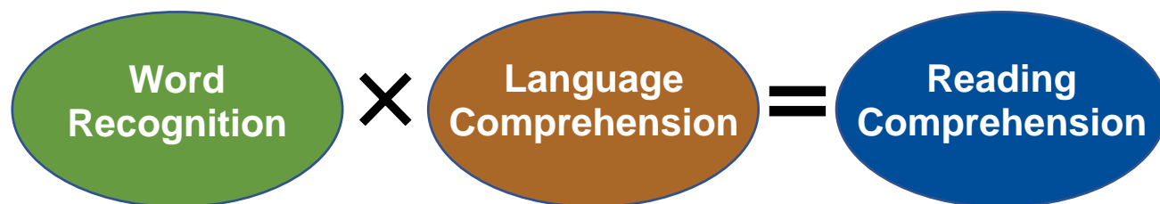
Figure 1. Simple View of Reading

When considering early reading instruction, it is helpful to keep in mind that most reading skills fit into two large components: word recognition and language comprehension (see Figure 1).