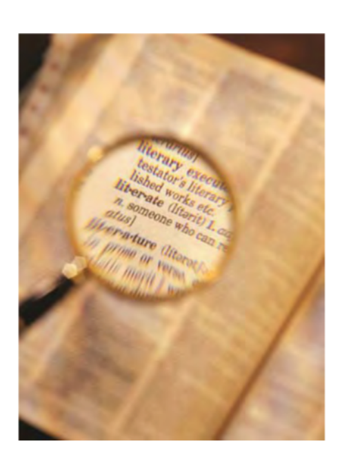
End-of-Instruction ACE English III