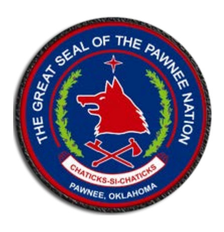
Flag of the Pawnee Nation

Tribe: Pawnee Nation of Oklahoma Tribal website(s): http://www.pawneenation.org/